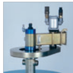
Gear reduction arm allows drilling of holes with diameter of up to 1,000 mm