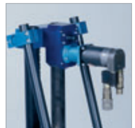
Effective drilling using hydraulic feed