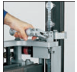
Quick installation on Tyrolit Hydrostress standard rails