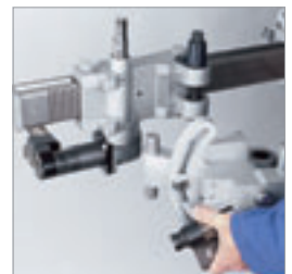
Simple handling thanks to quick release fitting