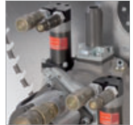
Robust saw head with standard hydraulic motors