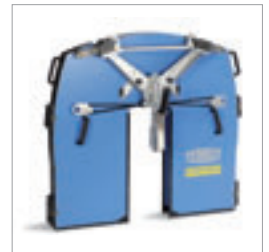
Blade guard for normal and flush cutting