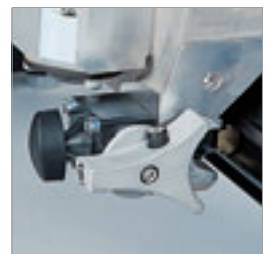
Simple saw head installation thanks to Y-carriage guide with fine adjustment