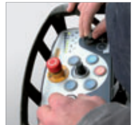
All functions controllable via remote control unit