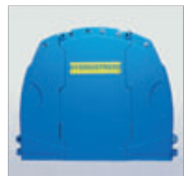
Quick and handy ALL-IN-ONE blade guard for corner, flush and normal cutting