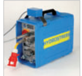
Controller for 16 and 32 A operation. Light and easy to transport - weighs just 19 kg