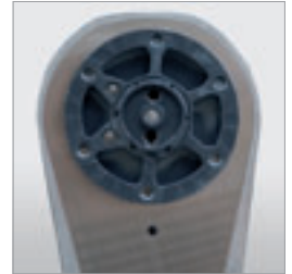
Compact saw head with belt-drive swivel arm