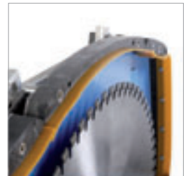
System blade guard for flush and normal cutting