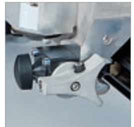
Slide guide with ergonomic locking system and fine adjustment