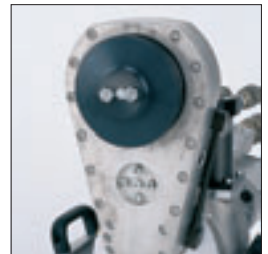
Geared swivel arm with quick-release flange for easy blade change