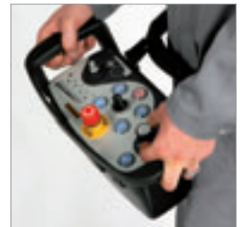
All functions controllable via remote control unit