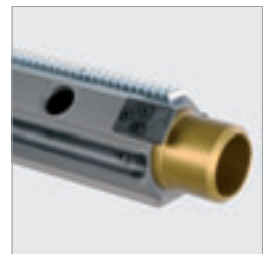
Compatible with VAS rail system