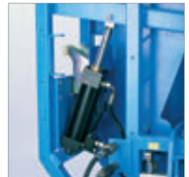
Quiet running because of hydraulic wire tensioner