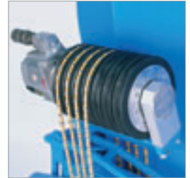
Good power transmission because of multiple roll drive