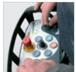
All functions controllable via remote control unit