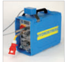
Controller for 16 and 32 A operation. Light and easy to transport - weighs just 19.5 kg