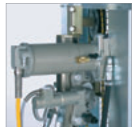
Main and feed motor