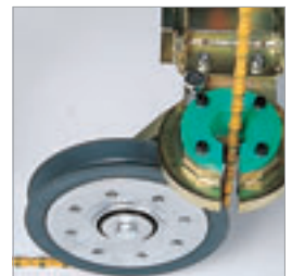
Wire can be placed into the machine intact