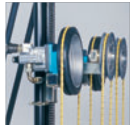
Sophisticated wire store