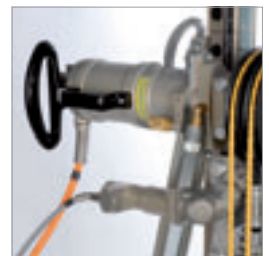
Electric main and feed motors for extremely smooth wire conserving sawing