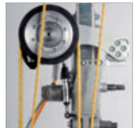
Fine feed control – ensures maximum freedom using new, innovative damping system