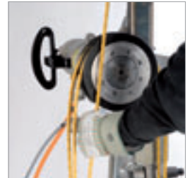
Extremely simple operation of wire storage unit